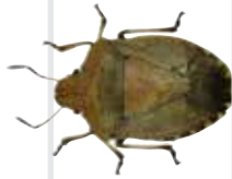
Brown shield bug ( Dictyotus caenosus ). Approx 10mm long Present in New Zealand