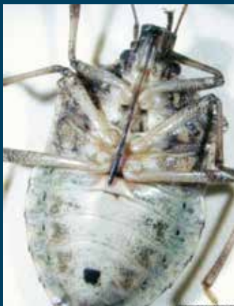
Underside of adult insect.