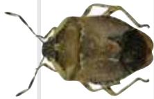
Pittosporum shield bug ( Monteithiella humeralis ). Approx 9.6mm long Present in New Zealand