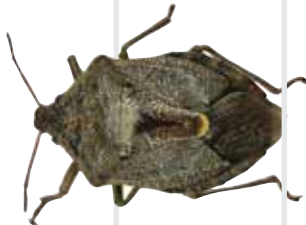
Brown soldier bug ( Cermatulus nasalis ). Approx 15mm long Present in New Zealand