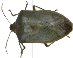
Brown form of Green Vegetable bug ( Nezara viridula ). Approx 17mm long Present in New Zealand