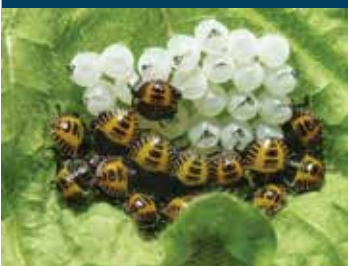
Eggs with emerging nymph stage insects.