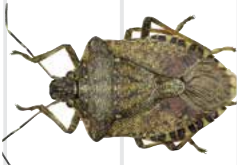
Brown marmorated stink bug ( Halyomorpha halys ). Approx 17mm long NOT Present in New Zealand